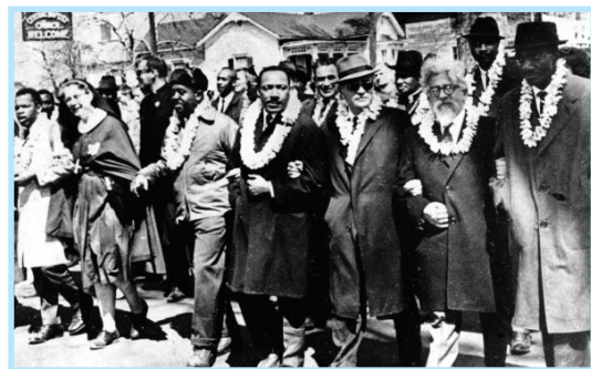
Rabbi Abraham Joshua Heschel (second from the right to Dr. King) was one of the spiritual giants of the 20th century. He spent his career as Professor of Jewish Ethics and Mysticism at the Jewish Theological Seminary. Heschel was famous both for his beautiful and stirring writings and for his involvement in the social justice issues of his day, particularly the American Civil Rights Movement and the struggle against the Vietnam War.

The prophet is a man who feels fiercely. God has thrust a burden upon his soul, and he is stunned at man's fierce greed. Prophecy is the voice that God has lent to the silent agony. It is a form of living, a crossing point of God and man. God is raging in the prophet's words.